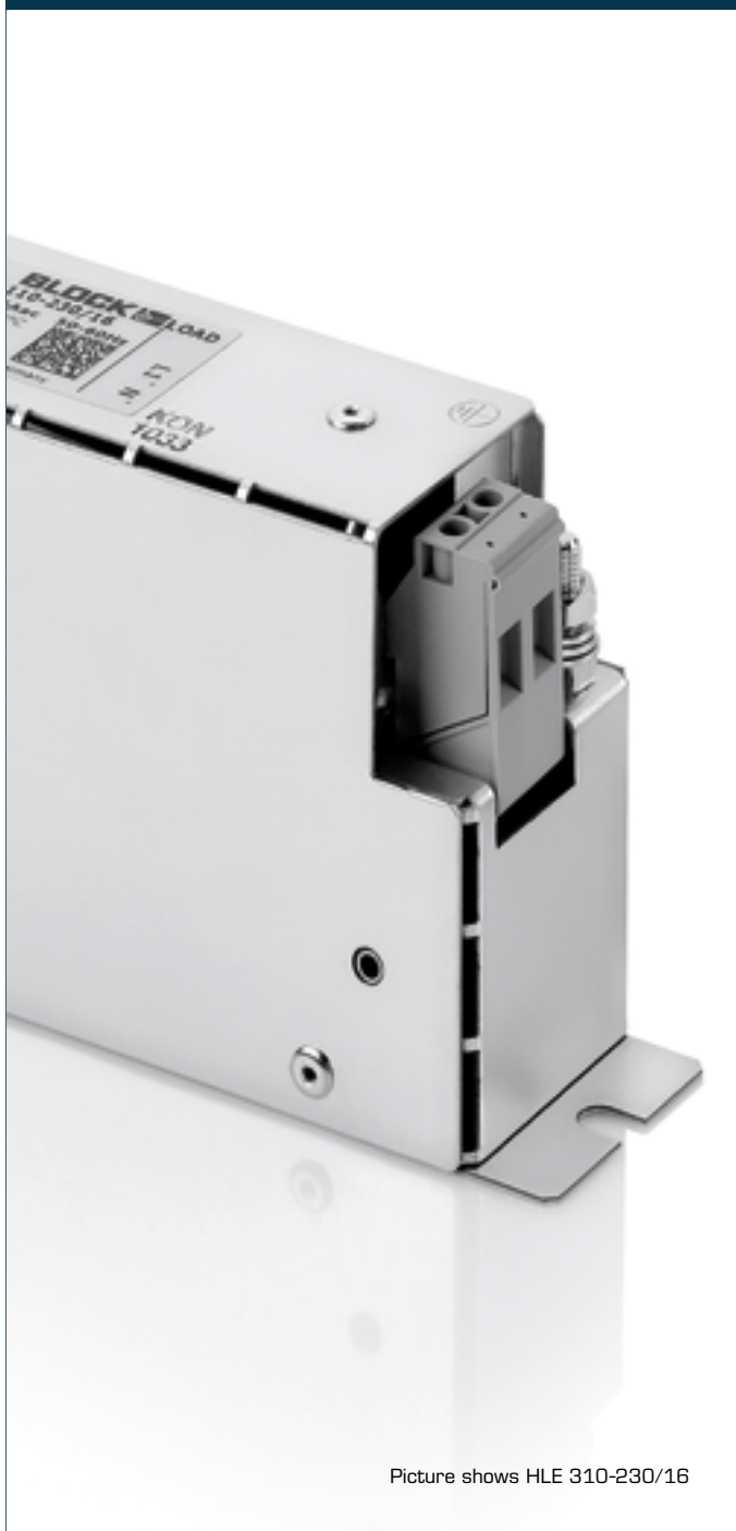
Picture shows HLE 310-230/16